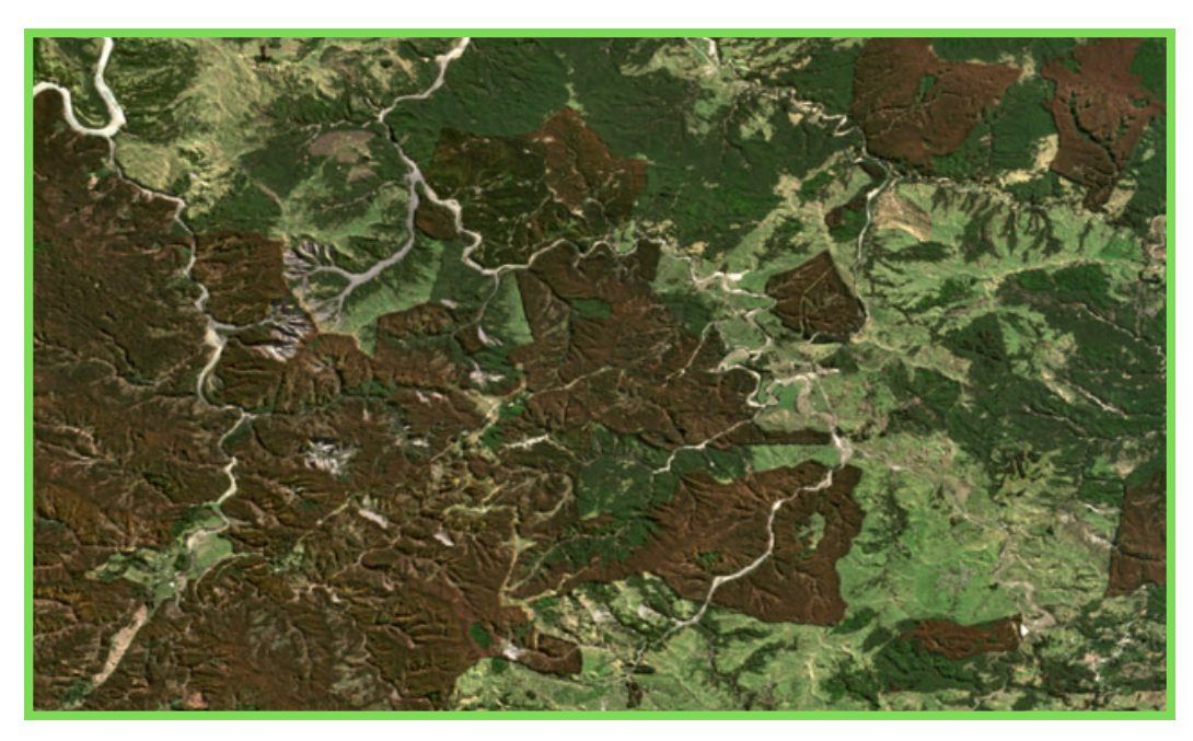
SATELLITE IMAGES FROM AUGUST 2022 AND 2023 ILLUSTRATE THE IMPACT OF RED NEEDLE CAST ON EAST COAST FORESTS.

Red needle cast (RNC), an unyielding fungal-like disease, has been wreaking havoc on pine trees in NZ since at least 2008. Infections cause pine needles to lose their colour and fall to the ground, with research showing that defoliation can impact growth for three years after the trees show symptoms.